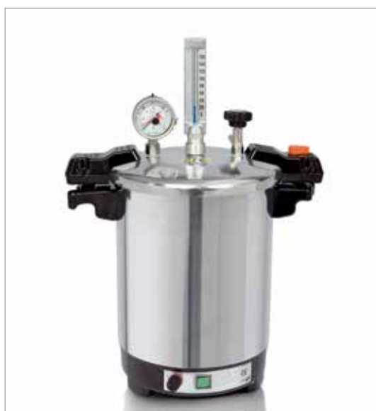
Steam sterilizers and autoclaves