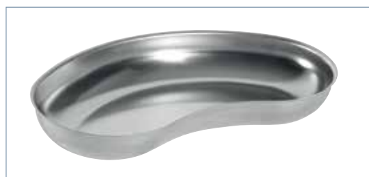
Laboratory equipment like tables, chairs, trays, and lamps