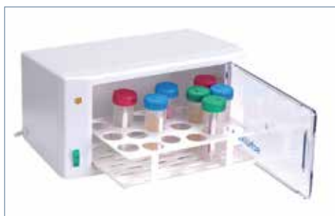
Incubators, thermal cyclers