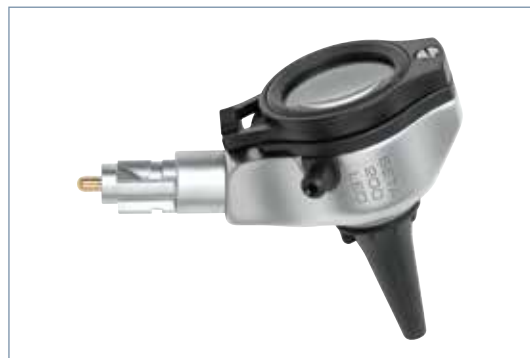
Otoscopes, fetal Doppler, sphygmomanometers