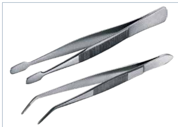
Instruments, e. g. forceps, scissors, razors tongs