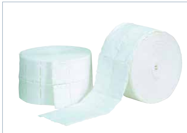
Wipes, towels, medical rolls, papers