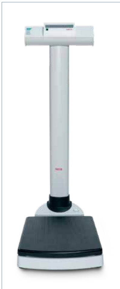
Weighing and measuring systems

Fleischhacker supplies almost every diagnostic tool, cost-efficient or branded, in order to support clinical labs with medical devices like ophthalmoscopes, thermometers, scales, blood-giving sets, sample collection kits, and many more.