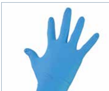
Protection items like gloves, shoes, masks