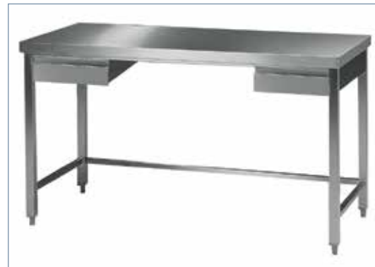
Laboratory equipment, e.g. tables, chairs, sinks, water distillation systems