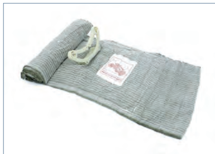
Blood stopping Israeli bandage and burn treatment