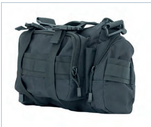
Emergency bullet-wound treatment sets