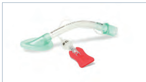
Intubation and thyrocricotomy products like larynx masks, tubes, and laryngoscopes