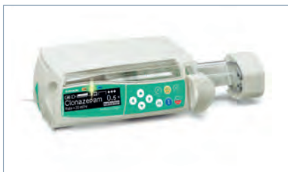
Medical devices, e. g. ECG, patient monitoring, and syringe pumps