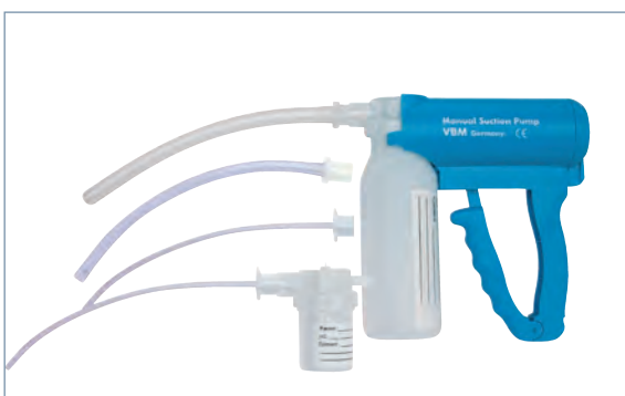
Different-sized suction units