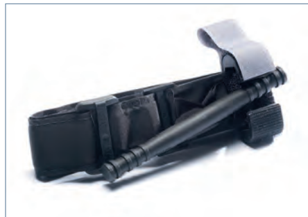
Compact tourniquet systems