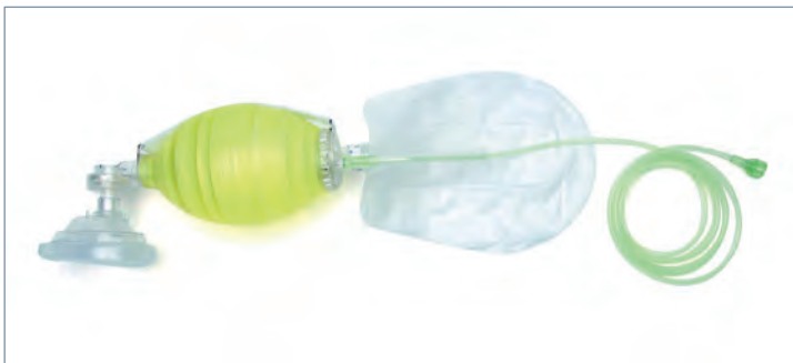
Ventilation products like pocket masks and resuscitators

Non-breathing patients are a typical part of emergency situations. Easy-to-use airway management can save lives. Fleischhacker offers classical equipment like masks, tubes, and larynx masks. But also brand-new disposable airway systems like the Ventrain® system.