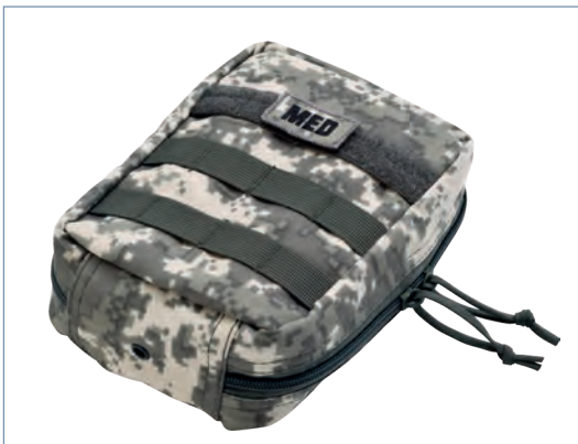
Individual first aid kits including wound treatment dressings

The trauma bag contains all necessary equipment for basic and advanced life support (ALS, BLS, and ACLS) in case of, e. g. gunshots, heart attacks, and other vital issues.