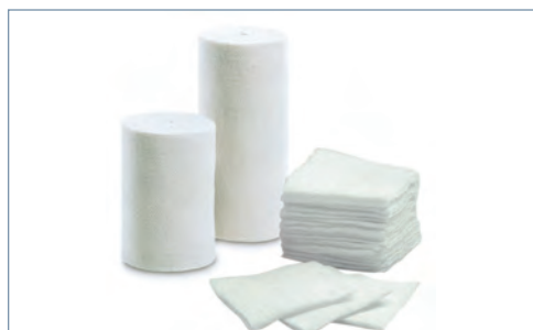
Wound treatment like dressings and compresses